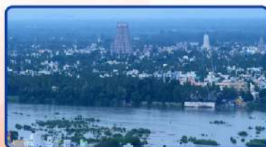
Srirangam - Thula Kaveri Snan