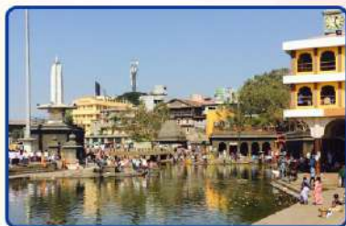
Panchavati - Godavari Snan

We shall take bath in various sacred rivers of our Bharatha Desham to get purified and rejuvenated