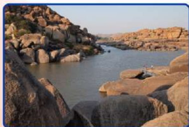
Kishkinda - Tungabhadra Snan