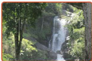
Mysore - Lakshmana Teertha Snan