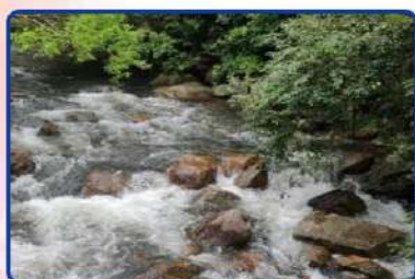
Tirukkurungudi - Nambi Aaru Snan